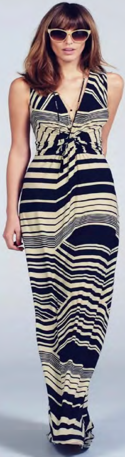
Zeena Striped Dress