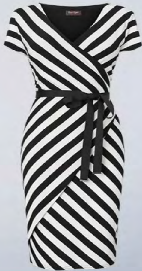
Coco Stripe Wrap Dress