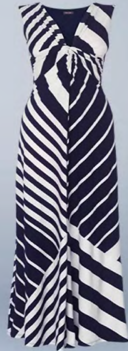
Portofino Stripe Maxi Dress