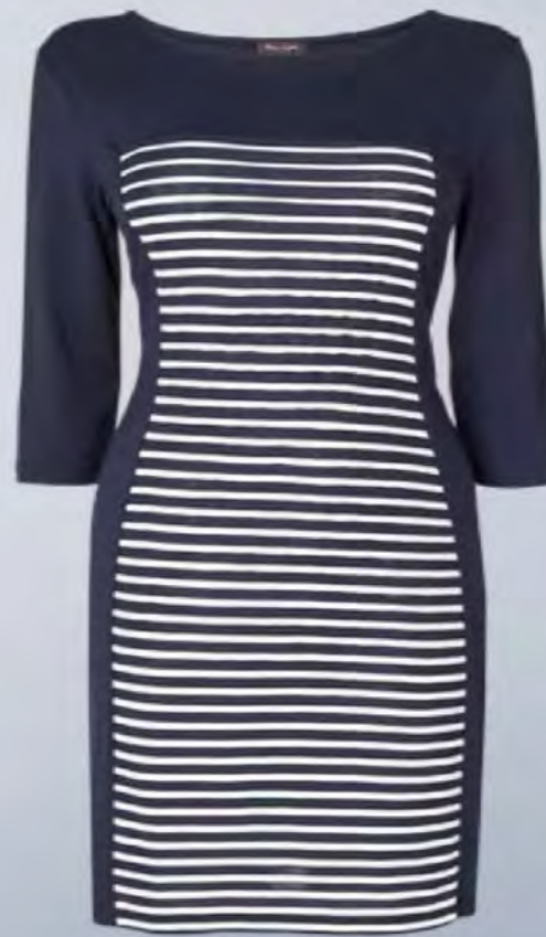
Linos Illusion Tunic